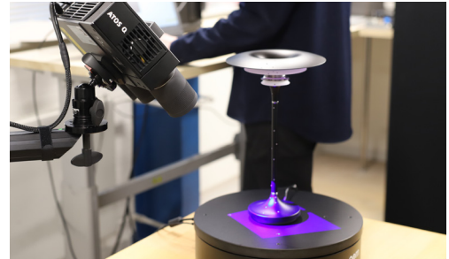
The first step is the 3D scan of our customer's lamp