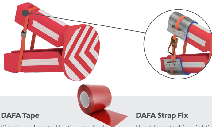
DAFA Tip Protector C30/L20