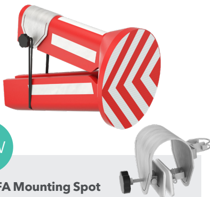
DAFA Tip Protector C30-MS

Different mounting options, so you can choose the one that fits your specific requirements.